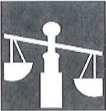
Southeastern Association of Legal Assistants— S.E.A.L.A.